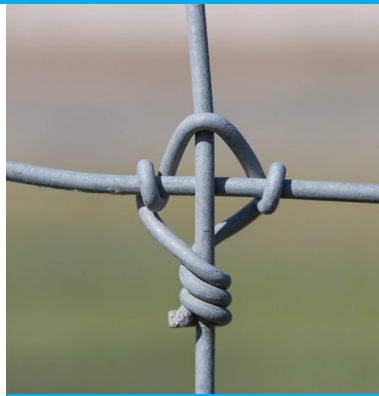
Fixed Knot: A locking fixed knot ties the vertical stay wires and the horizontal line wire together, providing maximum strength up to 1,385 pounds of pressure.