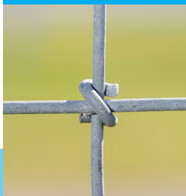
S-Knot: The smooth, snag-resistant, the S-knot also combats buckling and sagging.

Two options work well for free-range hogs: