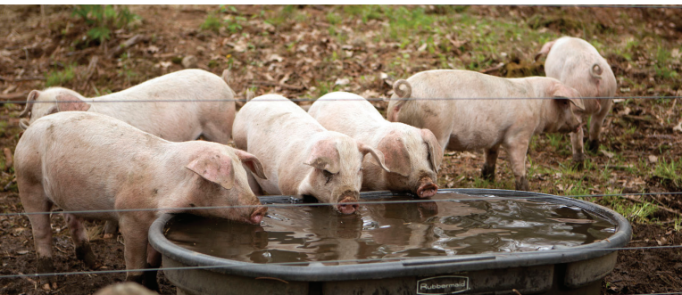
Two options work well for free-range hogs: 35-inch tall, fixed-knot woven wire fence or three to four strands of smooth electric wire.

"I am frequently asked, 'what fence is best for my daughter's two 4-H steers, the club lamb, three goats and an old horse that my wife rides once a month?' Believe it or not, there is a fence that will work to keep in a menagerie," Sarson says. He explains the best option for a wide mix of animals is a fixed-knot woven wire fence, 13 horizontal line wires, 48-inches tall and a 3 or 12-inch vertical (stay) wire. "Woven wire designs,